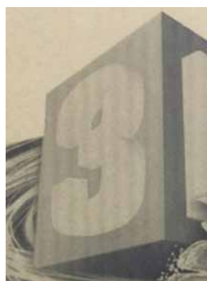
APC/TPC: Flute marks less visible