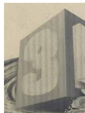
CONVENTIONAL: Flute marks highly visible